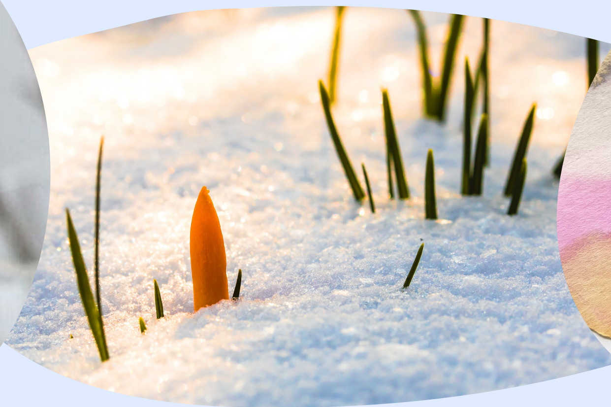
SPRING WATCH:CROCUS & TULIPS